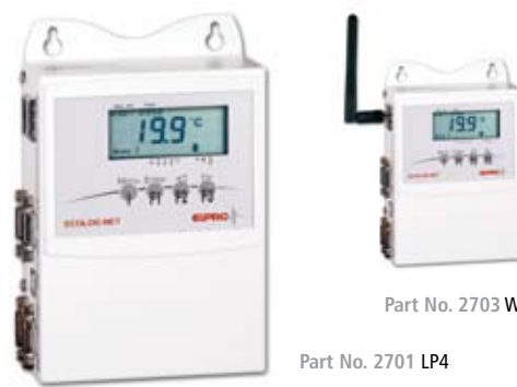
Part No. 2701 LP4 Part No. 2703 WP4 (wireless LAN)