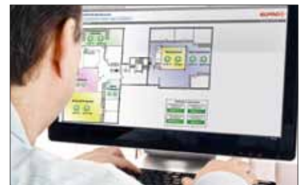
... in the office.