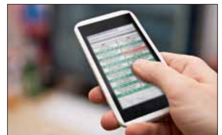
... or on the go.