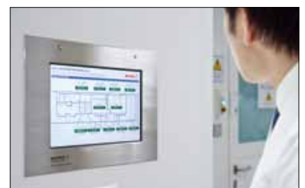
... before entering the cleanroom.